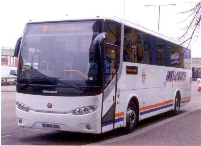
Envirox to be used in De Courcey's buses and coaches

Join the discussion on Twitter by following us at @cbwtweets and find us on Facebook at www.facebook.com/coachandbusweek